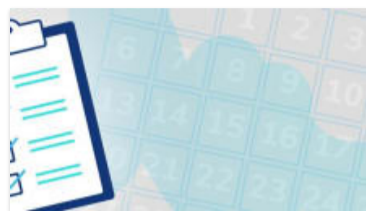
Discovery Workshops: Plan a Brilliant B2B Marketing Strategy for 2019