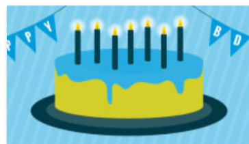
Why We've Got Cause To Celebrate (And How You Can Get In On It Too)