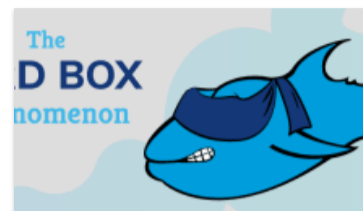
The Power of Digital Marketing and Hype of Bird Box